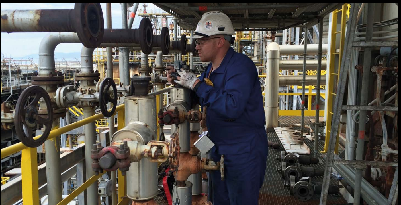
Below: Destec Inspector onsite at Milazzo Refinery.